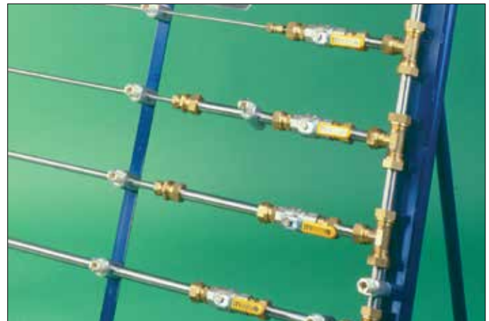
Control valves and pressure tapings

The C6-MkII-ABASIC and the C6-MkII-DTA-ALITE require a PC, running Windows 98 or above and a spare USB port (not supplied by Armfield).