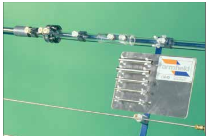
Clear acrylic pipe section and test pipe samples