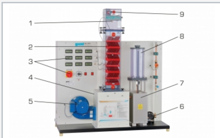
1 nozzle as atomiser, 2 wet deck surface, 3 displays and controls, 4 air chamber, 5 fan with throttle valve, 6 pump, 7 tank with heating, 8 tank for additional water, 9 combined temperature/humidity sensor