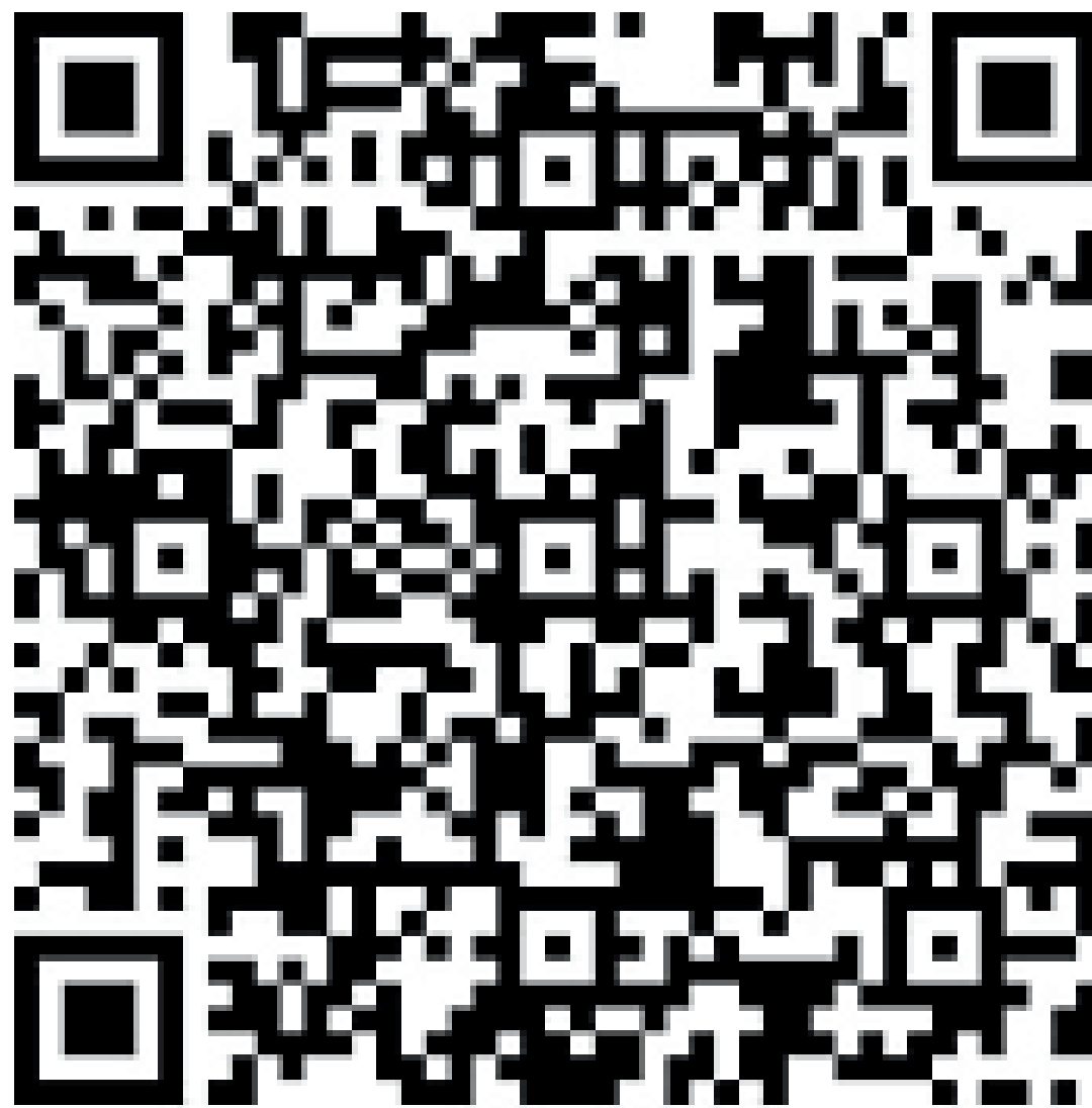
The Guide of IMSIU Excellence Award - Second Edition

The criteria for the branches of IMSIU Excellence Award were developed and refined by a group of experts and specialists in the award's branches and categories. These criteria emphasized objectivity and accuracy in evaluating the level of excellence across various fields. The details were announced and published in the award's dedicated guide. (Guide image)