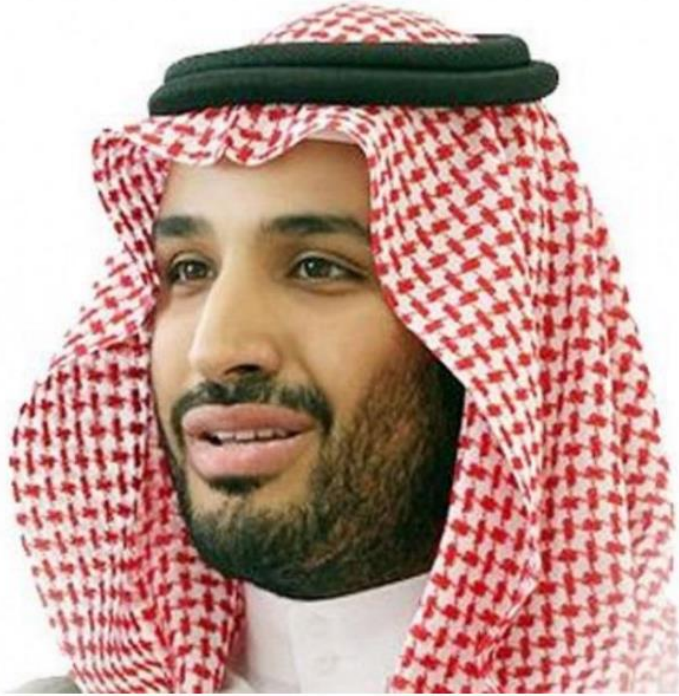
His Royal Highness Prince Mohammad bin Salman bin Abdulaziz Al-Saud Crown Prince, Deputy Prime Minister, Minister of Defense