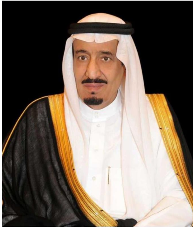
The Custodian of the Two Holy Mosques King Salman Ibn Abdulaziz Al-Saud King of the Kingdom of Saudi Arabia