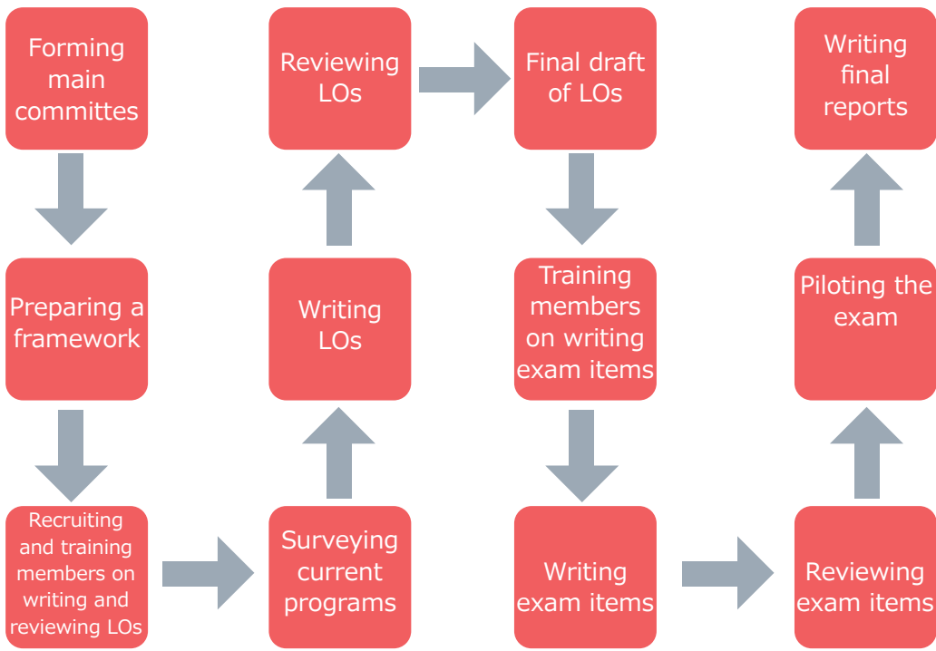
Figure 1. Stages of the LOs project